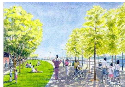
Harlem Waterfront Park – Community Driven Development